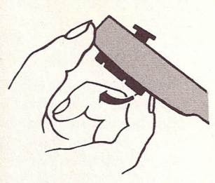
REMOVING THE METAL GUARD